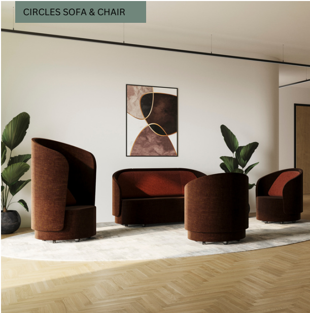
CIRCLES SOFA & CHAIR